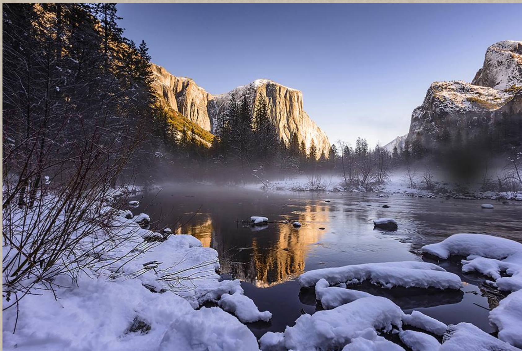
DISCOVERY HM | NATURE (ND)(DIGITAL) | VALLEY IN SNOW | MINH NGUYEN | USA