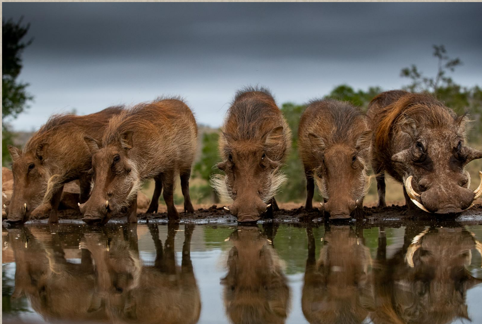
FFPC CM | NATURE (ND)(DIGITAL) | WARTHOG FAMILY 20190522071506 | | Sweden