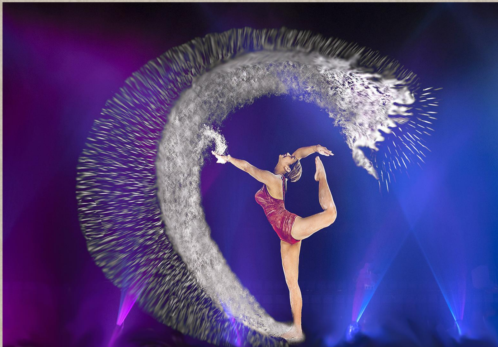
DISCOVERY HM | OPEN COLOUR (PIDC)(DIGITAL) | WONDERFUL DANCEGAK1 | WOODPECKER HUANG | Taiwan