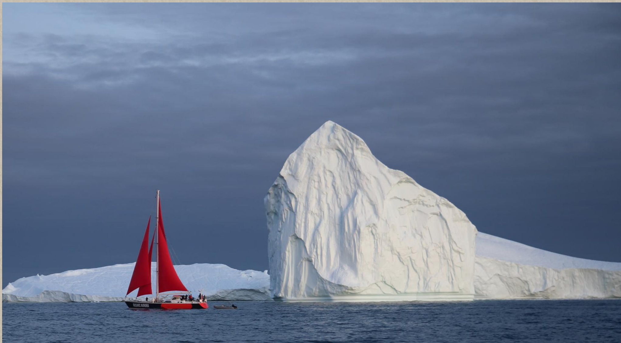
DISCOVERY Gold | OPEN COLOUR (PIDC)(DIGITAL) | MAJESTIC | RICHARD BAILEY | USA