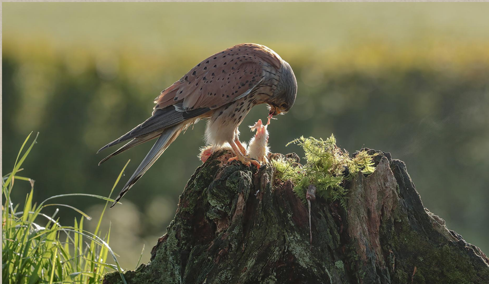
DISCOVERY HM | NATURE (ND)(DIGITAL) | KESTREL A BIRD OF PREY | KAREN SMALLEY | England