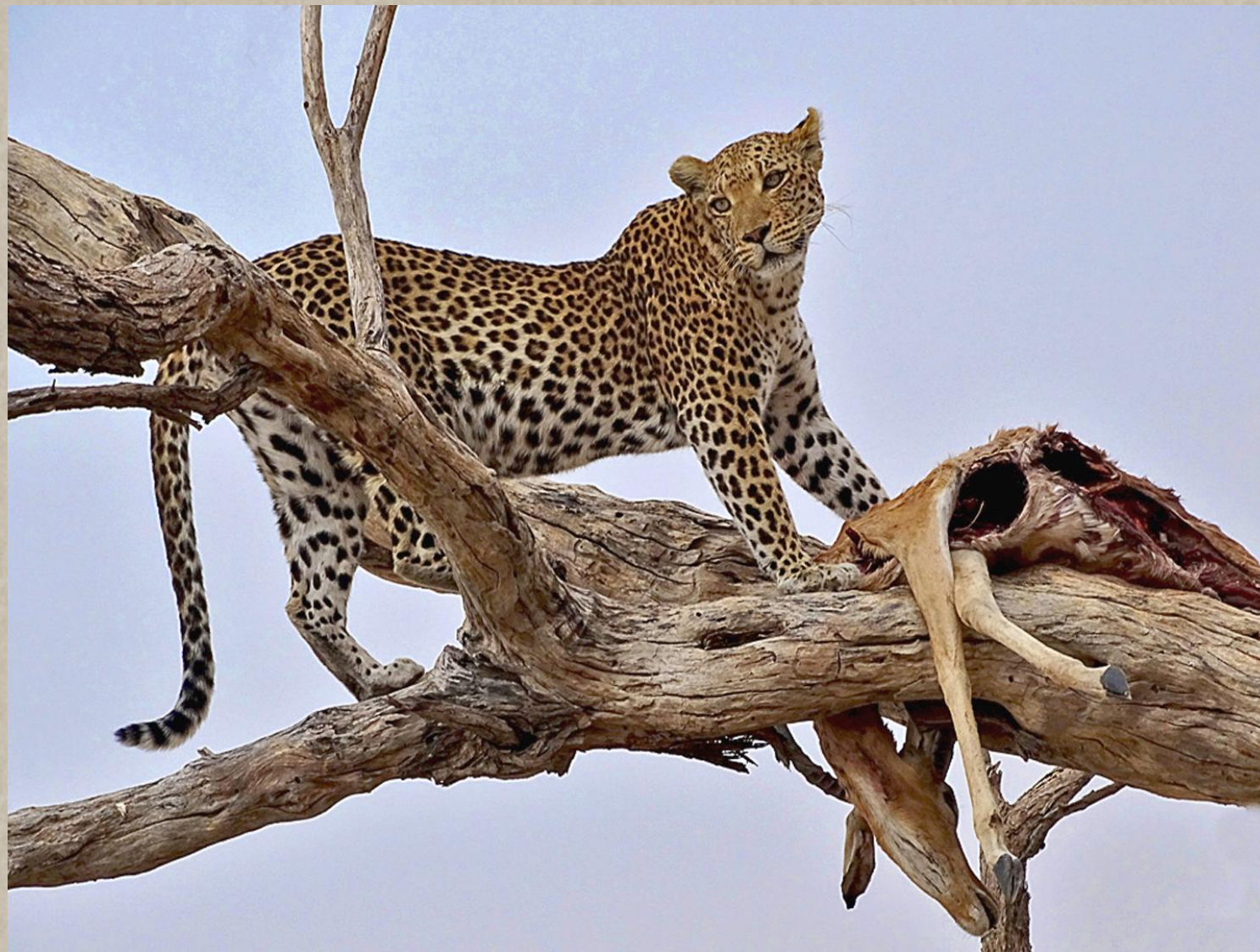
FFPC HM | NATURE (ND)(DIGITAL) | D2 OKAVANGO 3 123 | URS JENZER | Switzerland