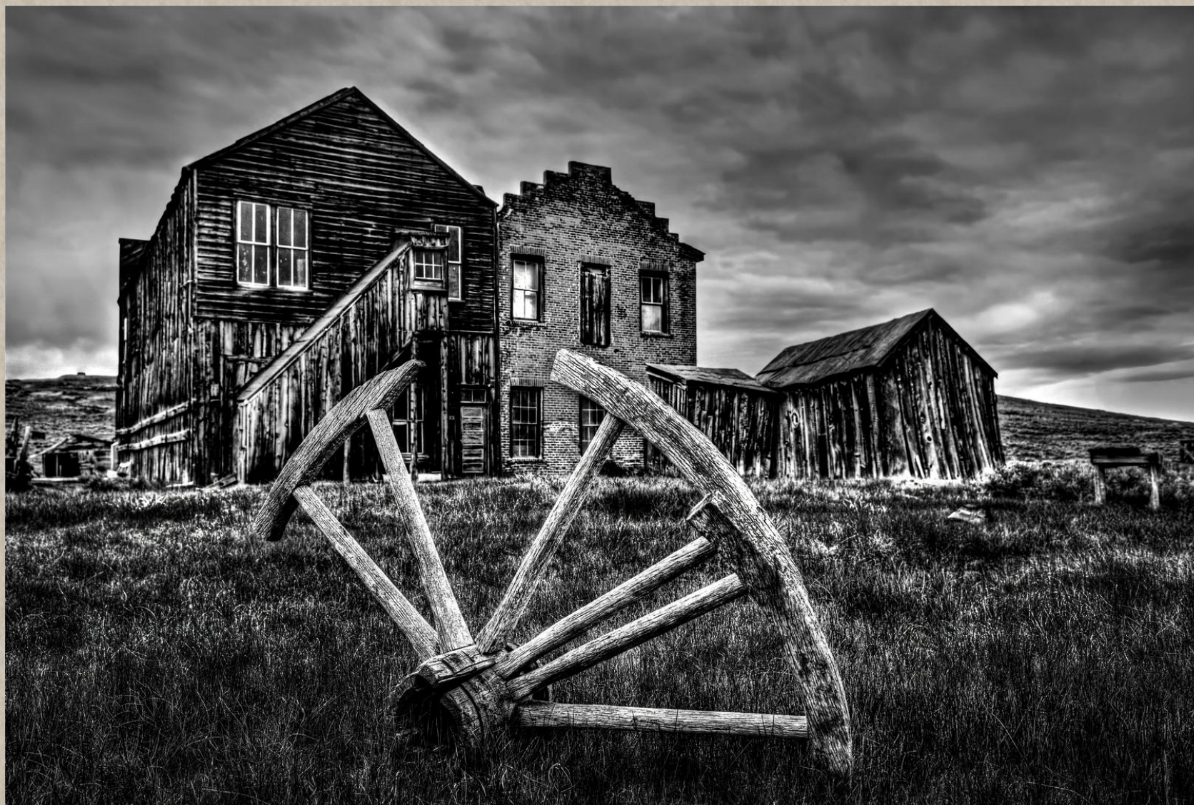
FFPC HM | OPEN MONOCHROME (PIDM)(DIGITAL) | BODIE GHOST TOWN | HENRY JANG | USA