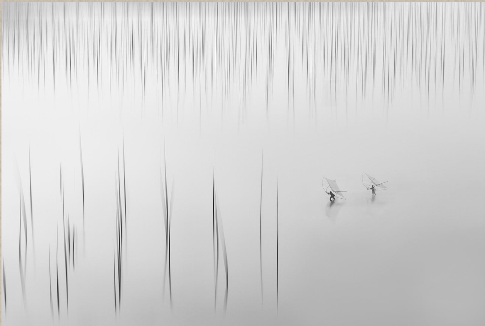
DISCOVERY HM | OPEN MONOCHROME (PIDM)(DIGITAL) | TWO_FISHERMEN_CATCHING_FISH | WEI LIAN | USA