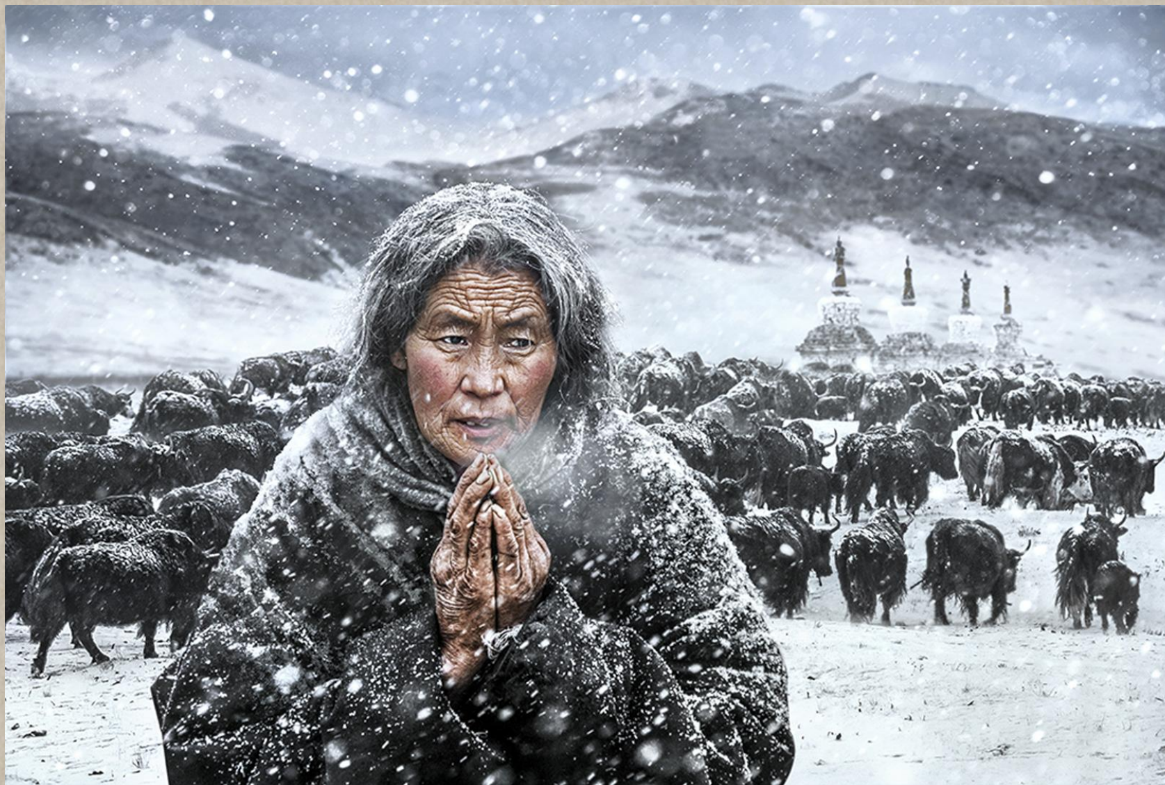
PSA GOLD | WOMAN (PIDC)(DIGITAL) | PRAY 3 | ARNALDO PAULO CHE | Hong Kong