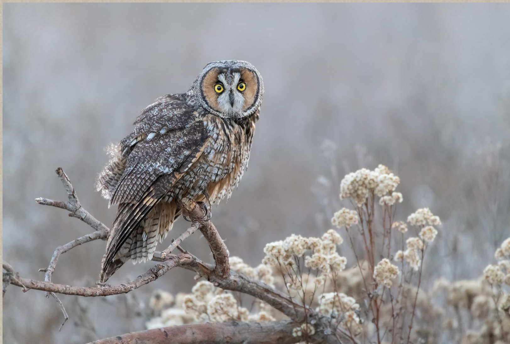
DISCOVERY Gold | NATURE (ND)(DIGITAL) | STARE-AT | WEI LIAN | USA