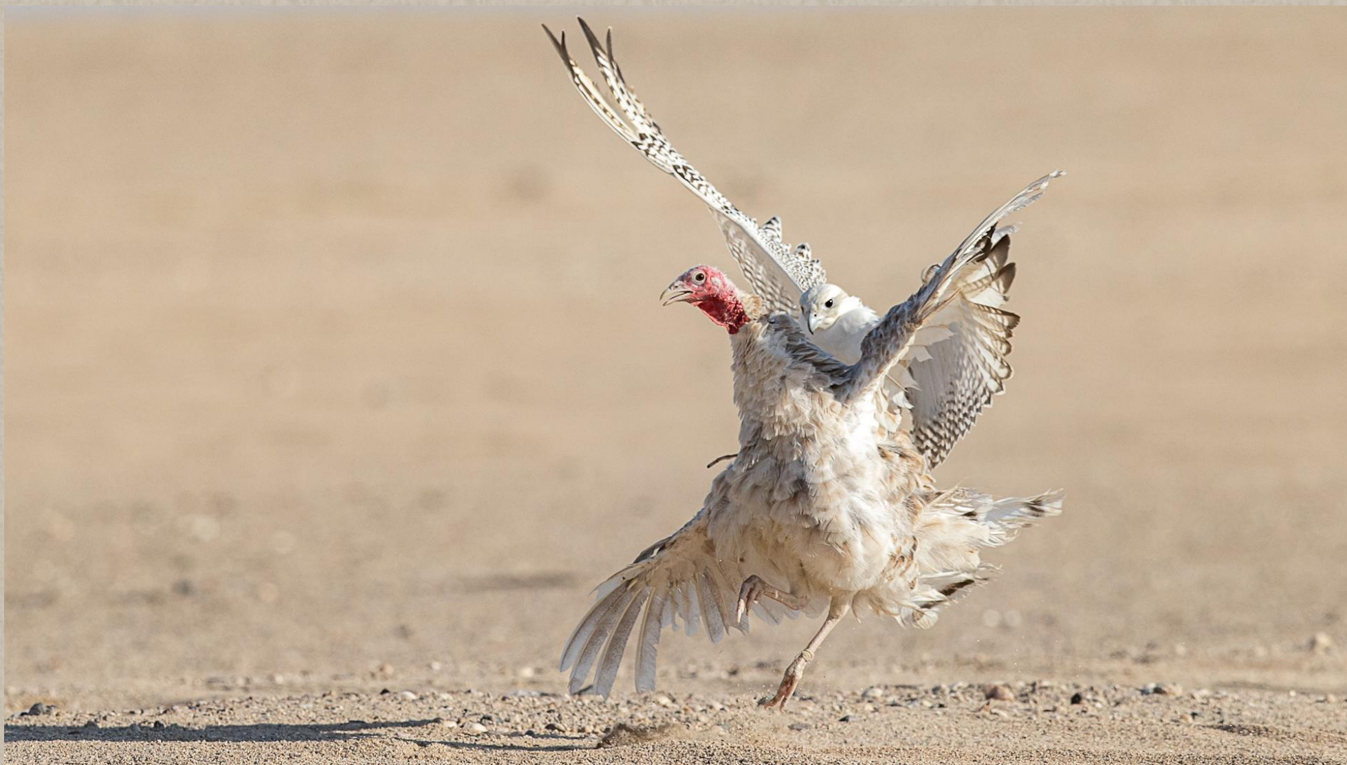
FFPC HM | NATURE (ND)(DIGITAL) | FALCON 6 | FAISAL ALLOUGHANI | Kuwait