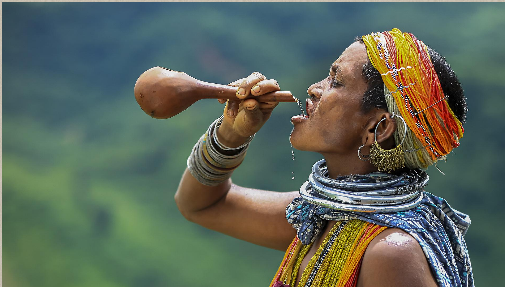
FFPC HM | WOMAN (PIDC)(DIGITAL) | DRINKING HOME BREW | | India