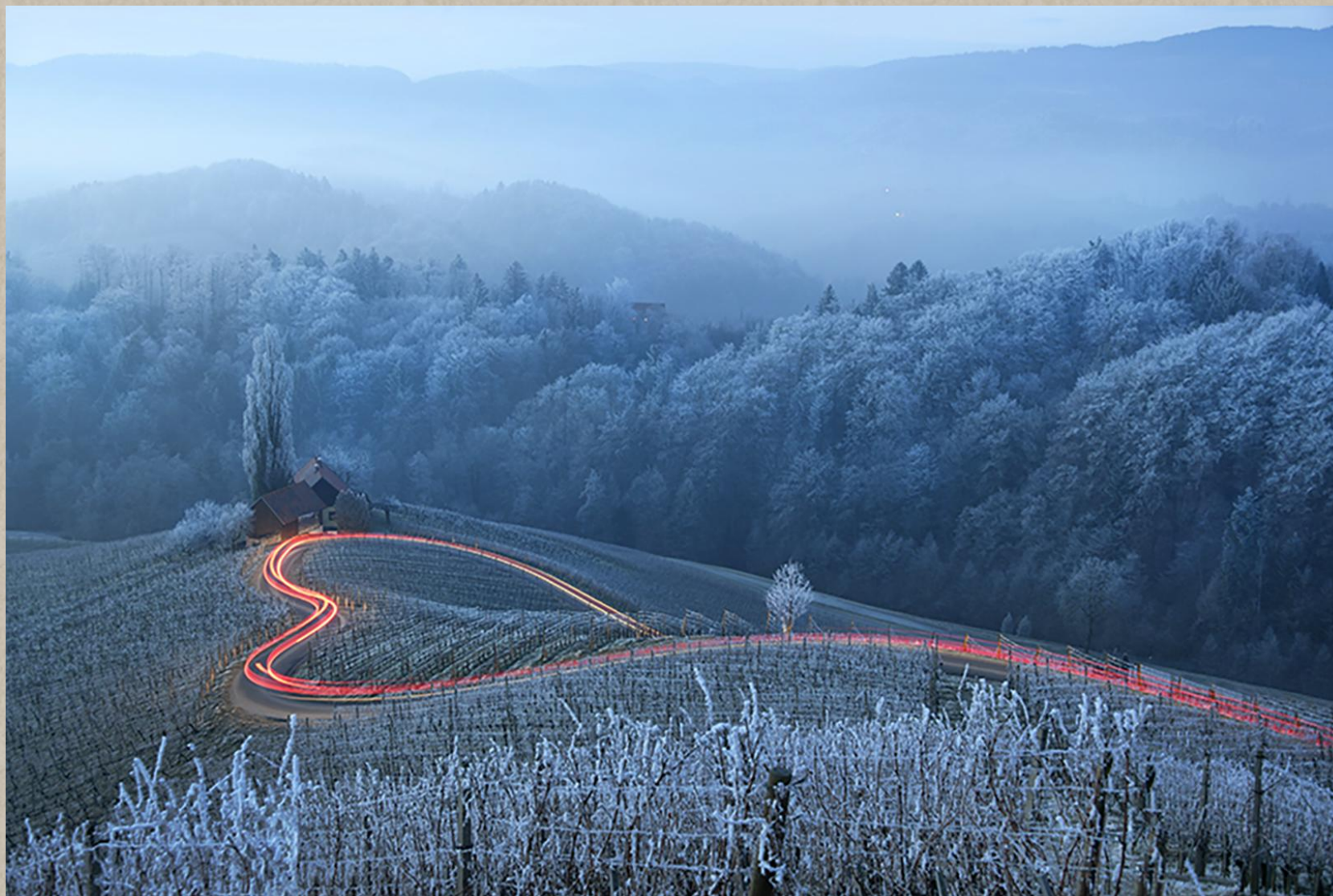
FFPC HM | OPEN COLOUR (PIDC)(DIGITAL) | THE HEART ROAD D J1080 | DIANA CHAN | Hong Kong