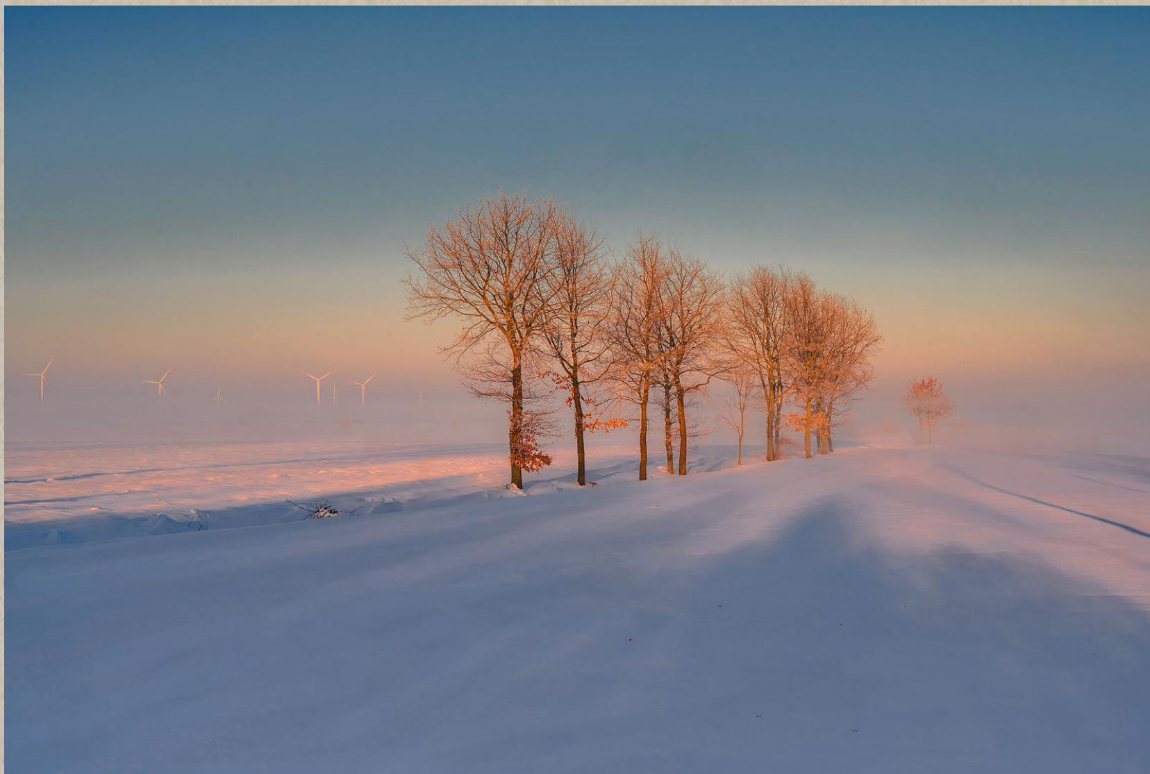
FFPC CM | OPEN COLOUR (PIDC)(DIGITAL) | WINTER TREES | JAN SIEMINSKI | Poland