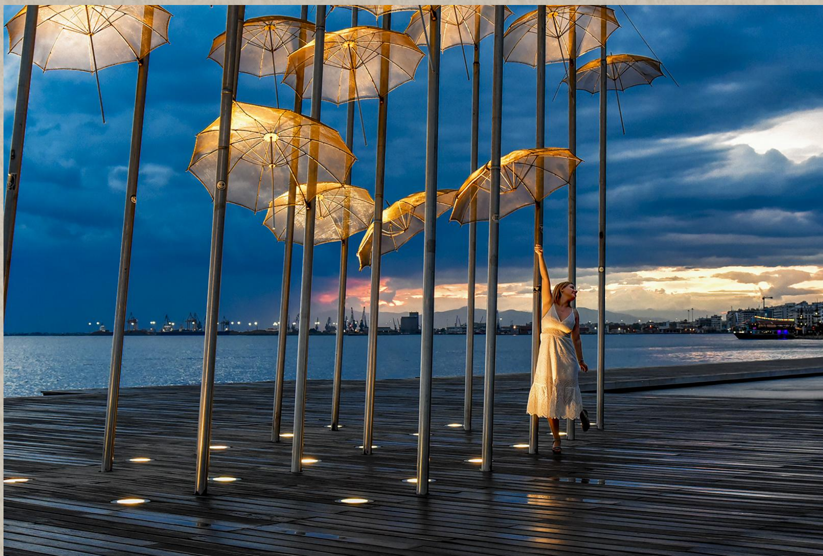
FFPC CM | WOMAN (PIDC)(DIGITAL) | LADY IN GLADNESS | CHRISTOS KONSTANTINOU - ACHERIoTIS | Cyprus