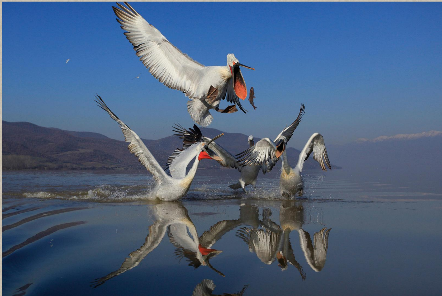
PSA GOLD | NATURE (ND)(DIGITAL) | PELLICANI DAL CIUFFO | RENZO MAZZOLA | Italy