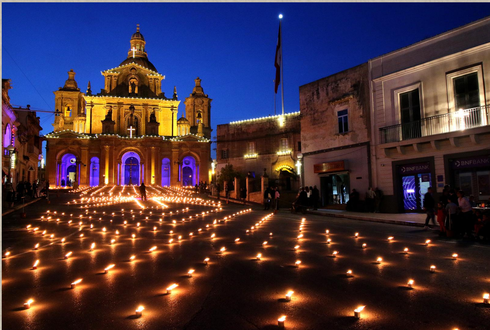
FFPC HM | OPEN COLOUR (PIDC)(DIGITAL) | SIGGIEWI FJAKKOLI 2 | GOTTFRIED CATANIA | Malta