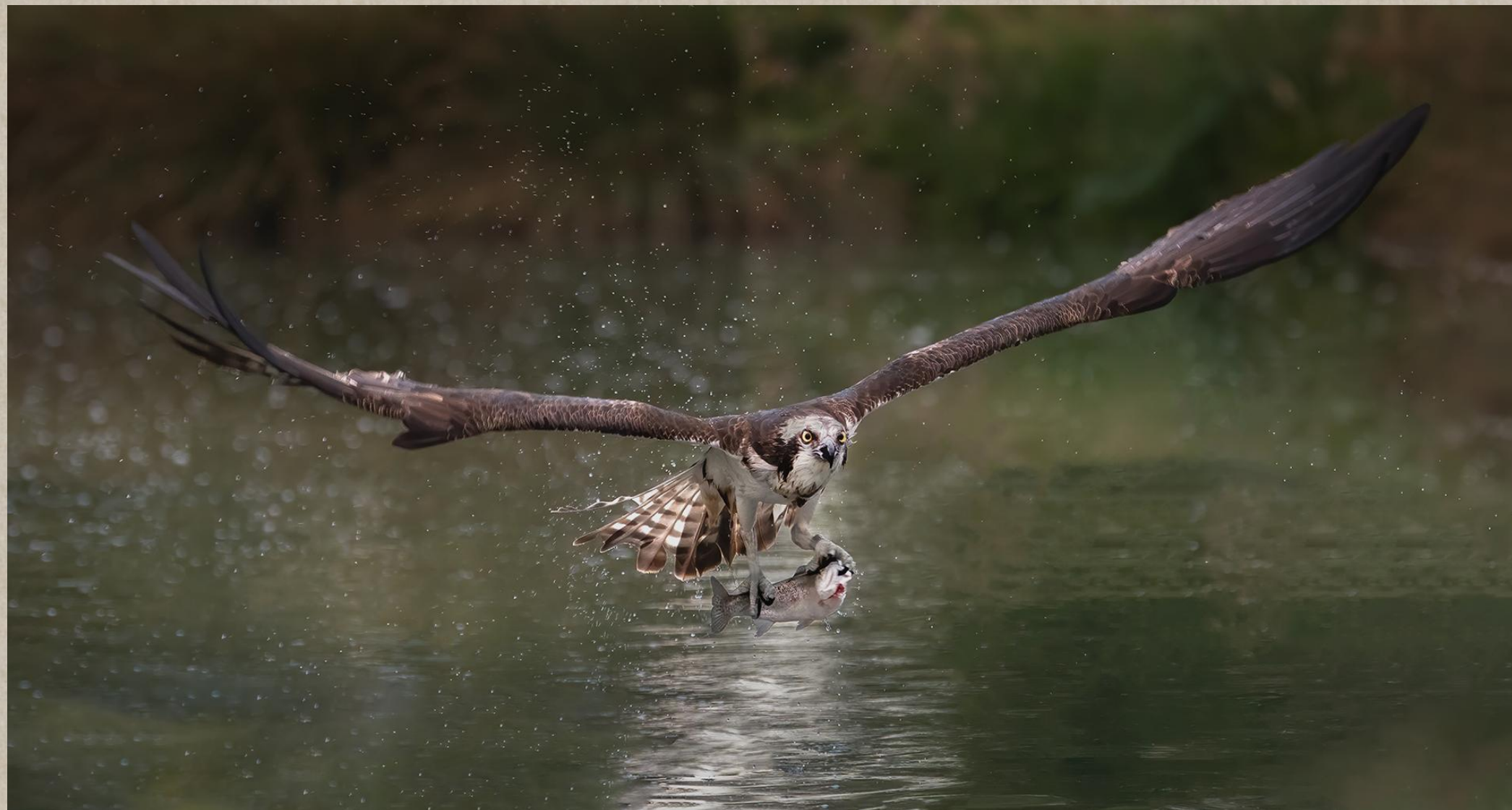
DISCOVERY Gold | NATURE (ND)(DIGITAL) | OSPREY CATCHING TROUT | COLIN BRADSHAW | England