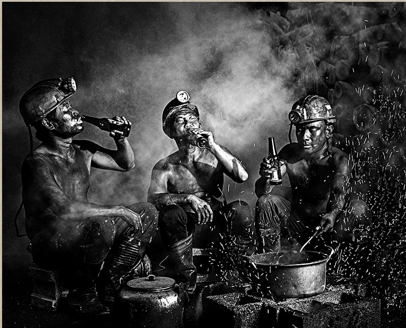
FFPC CM | OPEN MONOCHROME (PIDM)(DIGITAL) | AFTER WORK HARD BEER AK MONO | WOODPECKER HUANG | Taiwan